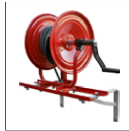
Hose reel 50 m